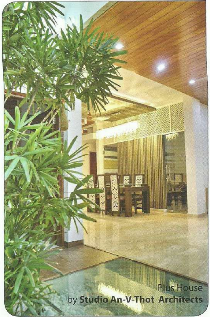
Plus House by Studio An-V-Thot Architects

Speaking of facade, the complete 25' high structure can be seen as volumes and voids sharing spaces, overlapping and inter-changing their behaviour as well as presence. The vertical edge of the corner is sliced open in a tapered hugging manner with MS pergola on the roof level adding the play of shadows & light. Insertion of MS jali is eminent at various places. Use of sober Orange textured paint balances its